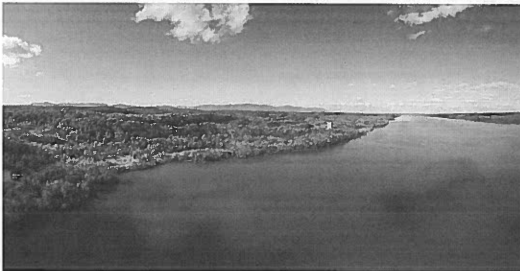
A new 508-acre park is within walking distance for many residents of Kingston

A new 508-acre state park in Kingston, Ulster County, that will protect over a mile of waterfront and create a series of trails that interweave with the Empire State Trail. Scenic Hudson would welcome the opportunity to provide a tour of this unique site within walking distance of a prominent Mid-Hudson city to members of the Legislature.