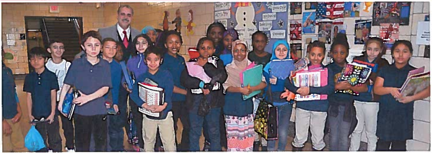
Putting Children and Families First to Ensure High Academic Achievement for ALL