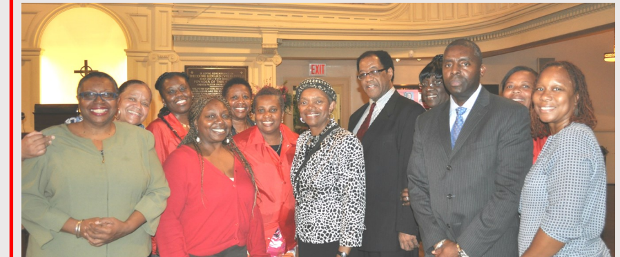
Senator Montgomery with members of CWA Local 1180

The event was co-sponsored by the New York State AFL-CIO, New York State United Teachers (NYSUT), New York State Nurses Association, Transport Workers Union Local 100, Council of School Supervisors & Administrators (CSA), CWA Local 1180, District Council 1707, 32BJ SEIU, UFCW Local 1500, United Federation of Teachers (UFT), Teamsters Local 237, District Council 37 (DC 37), United University Professions (UUP), UAW, Region 9A.