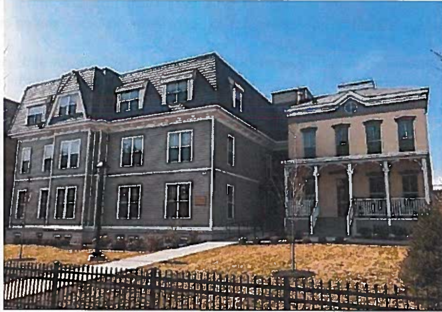
Albany Damien Center, Albany