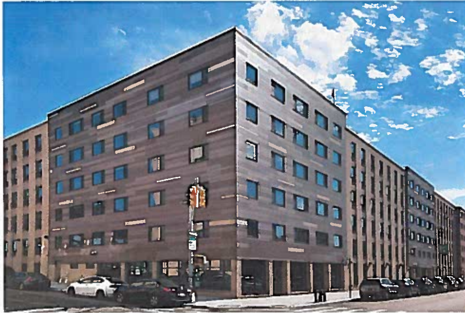
Win, Stone House Brownsville, Brooklyn

$5.2 million of HHAP funds helped leverage over $75 million in NYC subsidy and private investment. This is one of the final projects built under the NY/NY3 agreement between NYC and NYS.