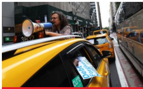
The 2023 NYC Labor Power 100