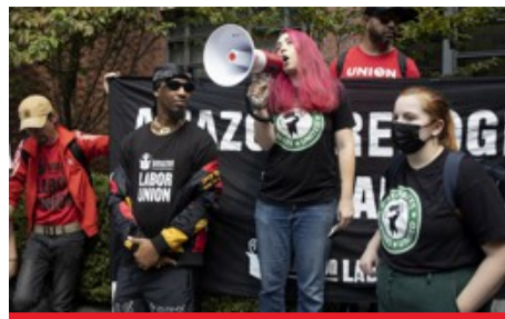
Corporate delay tactics are clouding union wins in New York