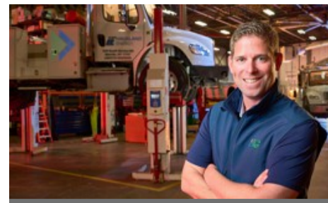
Building America's Future Depends on Developing a Skilled Workforce