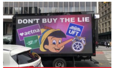
What you need to know about NYC retirees' health care fight