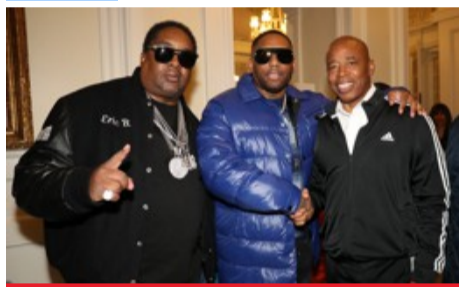
How hip-hop took over New York politics