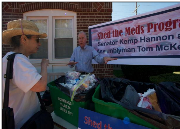
Senator Hannon explaining what happens to surrendered medication.

Many New Yorkers have unused medication in their homes and do not know how to properly dispose of them. The New York State Department of Environmental Conservation urges citizens not to flush their medications because it can pollute drinking water. 14 The situation becomes even more confusing after a loved one passes away. Routinely, surviving family members are left with bags of medication—much of which are controlled substances—from the care of their deceased relatives. In an attempt to make sure controlled substances do not get into the wrong hands, federal DEA rules make it more difficult to return them. These drugs can only be surrendered to law enforcement agencies. 15